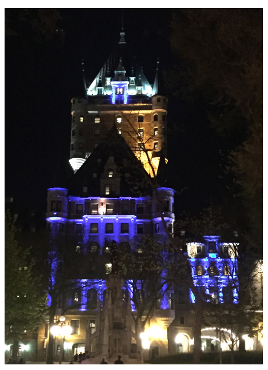
Le Chateau Frontenac in Quebec City, the conference center and hotel for the Enroll-HD Congress in May 2018, was lit up blue in honor of HD Awareness Month

opportunity to learn, connect, and express ideas that will propel HD research forward. Some of the highlights discussed included new initiatives and studies for the Enroll-HD platform, advances in HD research, and clinical findings that have provided novel insights into how HD develops, affects the body, and manifests in patients.